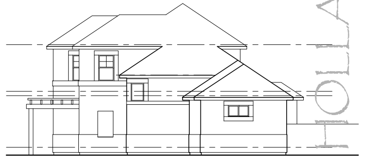
RIGHT ELEVATION Scale: not to scale