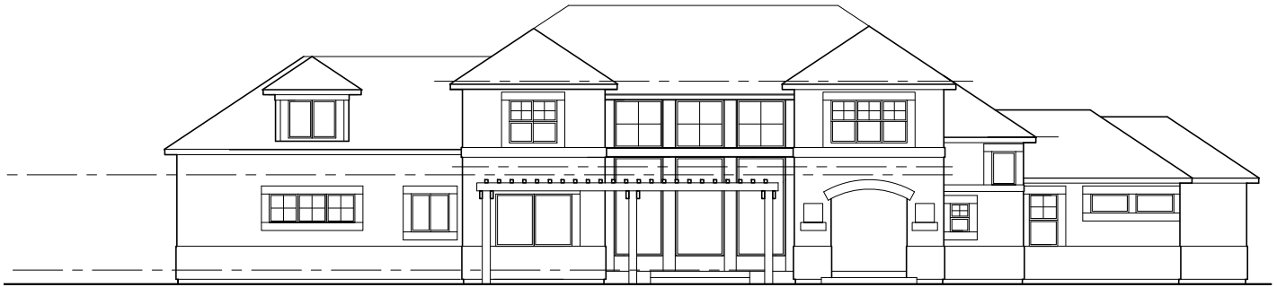
FRONT ELEVATION Scale: not to scale