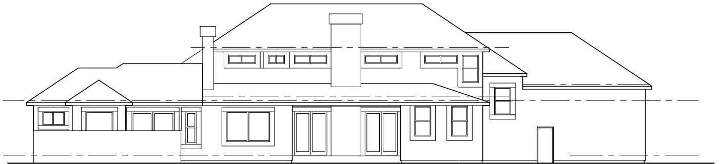
REAR ELEVATION Scale: not to scale